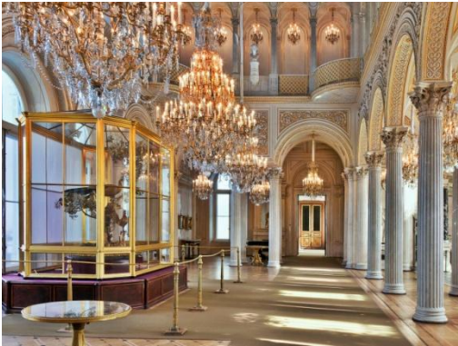
VIP entrance to the museums