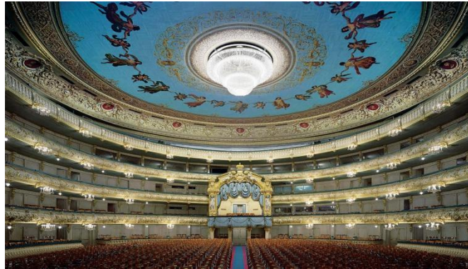
VIP box seats in the main theatres