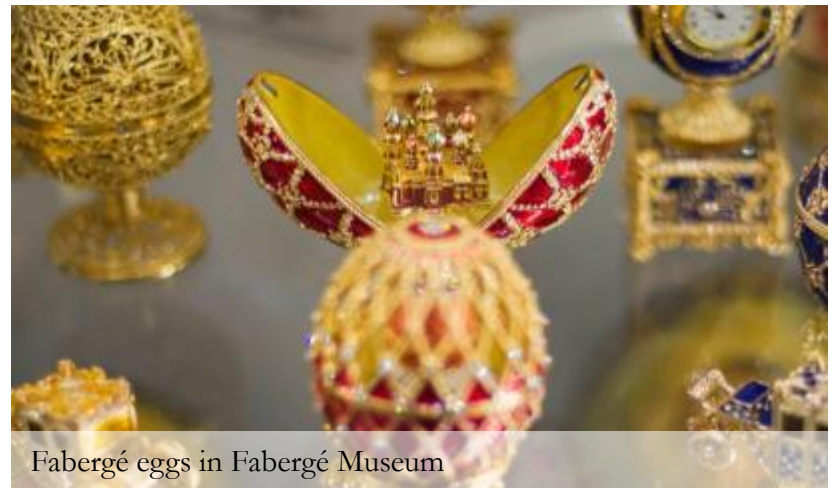
Fabergé eggs in Fabergé Museum