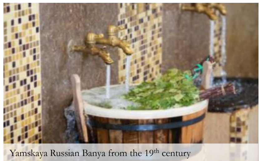
Yamskaya Russian Banya from the 19 th century