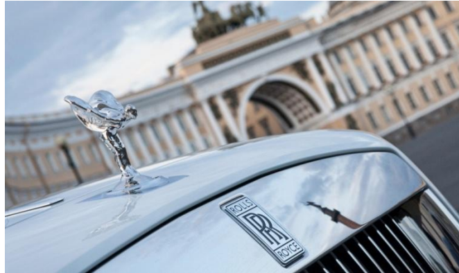
Private and collective transportation