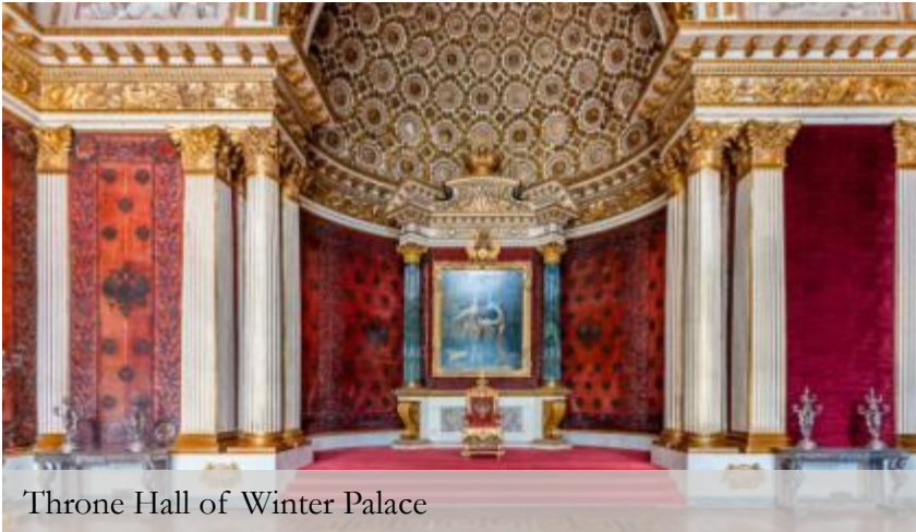
Throne Hall of Winter Palace