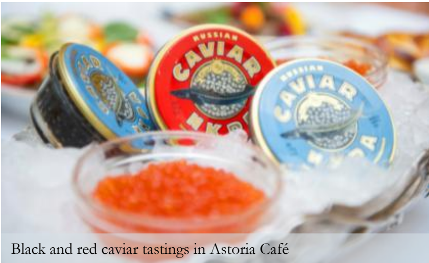
Black and red caviar tastings in Astoria Café