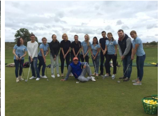
Immersion in the city life